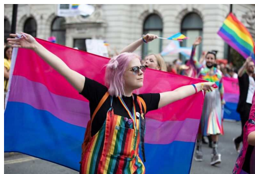
A bisexual flag at 2009 London Pride