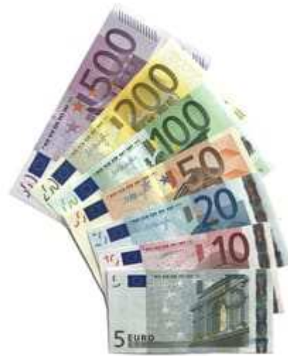
Euro currency rainbow banknotes