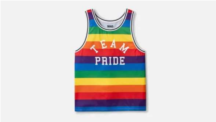
Fashion brand Supporting Pride