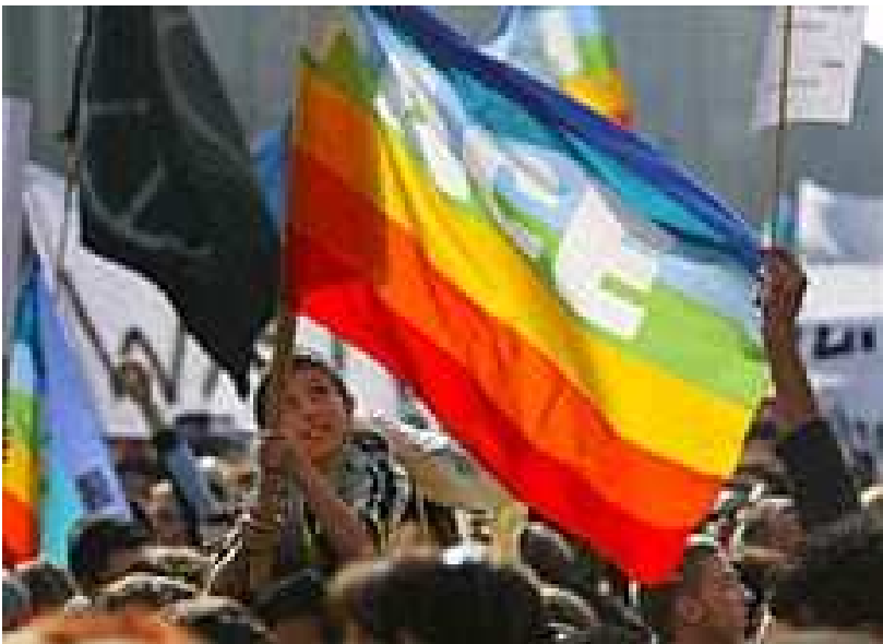
A Swiss protest for peace under a Rainbow Banner