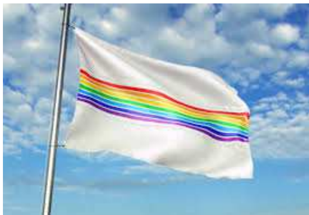
Flag of the Jewish Autonomous Region in Russia