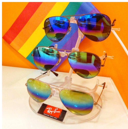
Ray Ban Pride Collection