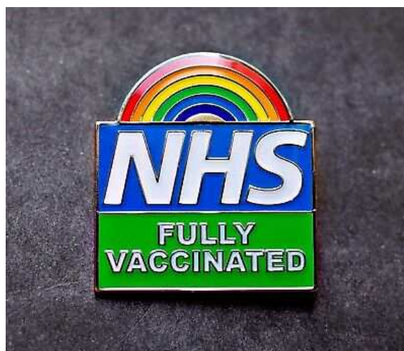
One example of NHS fully vaccinated badge

The NHS has now issued vaccine badges to be worn on clothing. These badges are specially designed to help identify those individuals who have been fully vaccinated.