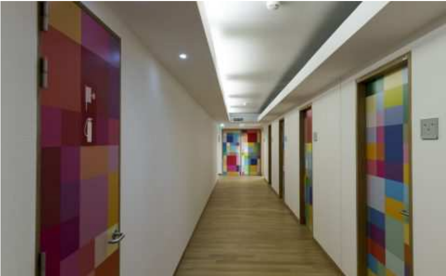
Offices of a European Union Building