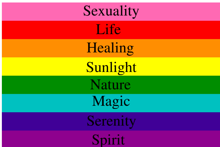
Baker's original eight-coloured Pride Flag

The current version has six colours, that consists of red, orange, yellow, green, blue and purple. It is flown horizontally, with the red stripe on top, like a natural Rainbow.