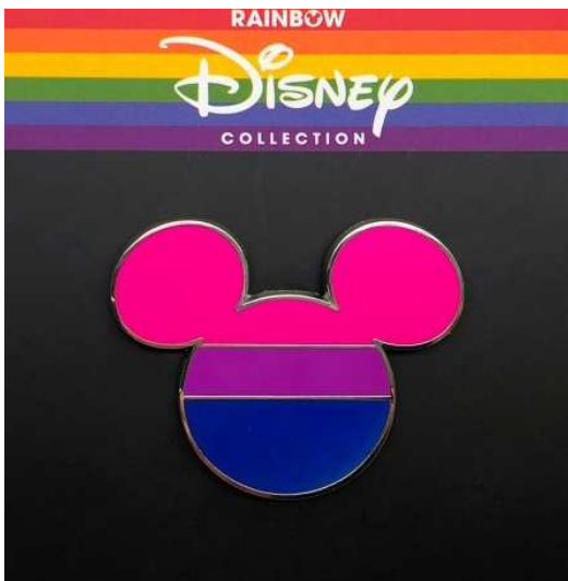
Disney’s efforts to “educate” children