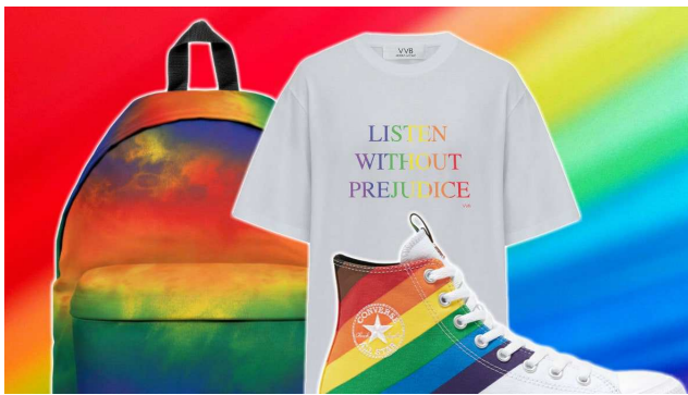
All Star Footwear