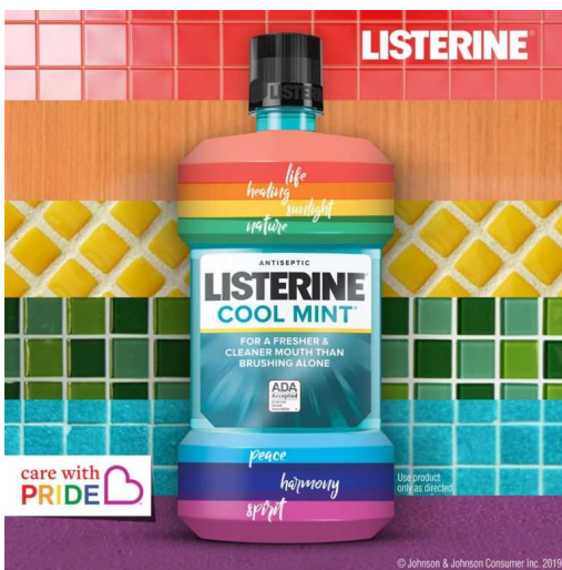
Listerine Dental products