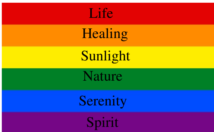
Modern six-coloured Pride Flag