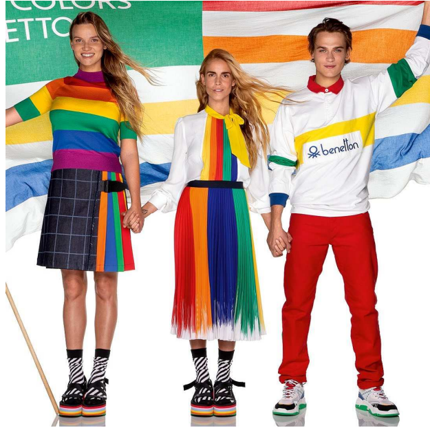
DISNEY and BENETHON “WE ARE ONE” Collection