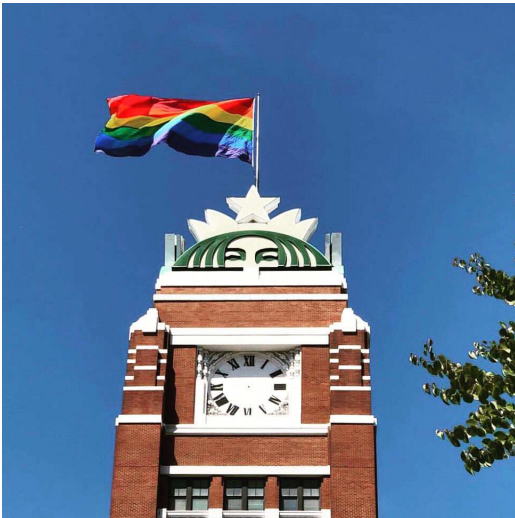
Starbucks raises the Pride Flag above Seattle Headquarters in support of Gay Rights