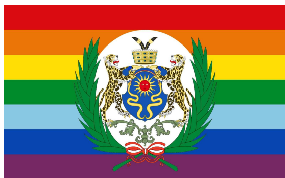
Flag of Cusco

In 1996 the Jewish Autonomous Region (Oblast) – created for the Jewish community in the 1930s by Josef Stalin in Birobidzhan, Russia – adopted the Rainbow Flag as its own symbol. Strangely, this did not violate the Kremlin’s “ban on gay propaganda.” This Region in Birobidzhan is said to be a sort of satellite government on the Chinese border.