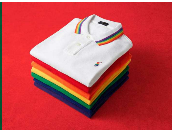
Ralph Lauren Pride Collection