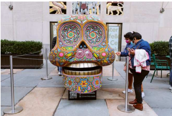
Creature at the Rockefeller center with rainbow-toned colouring