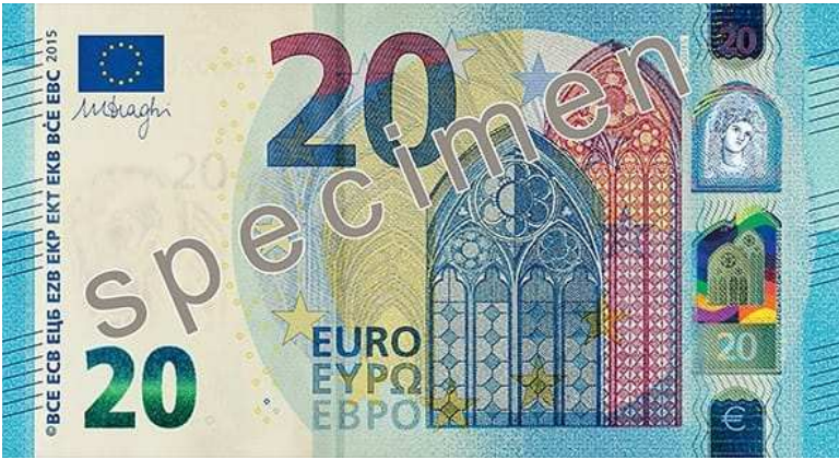
Notice the rainbow in the window