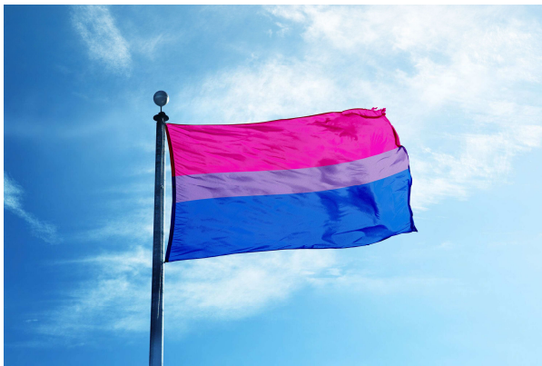
The Bisexual Flag

The colour purple is also very much used today by itself. According to Gilbert Baker the lavender stripe on his flag used alone symbolizes diversity. But more recently the purple stripe on the Pride Flag also symbolizes the “spirit” of the gay community. Therefore, shades of purple have been worn by participants on Spirit Day , an annual LGBTQ awareness day since 2010, to support the LGBTQ+ gay youth, said to be victims of bullying.