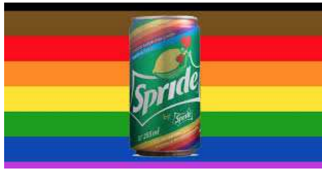
Soft Drinks Companies Coco Cola and Sprite