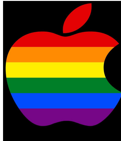
Apple's Pride Logo