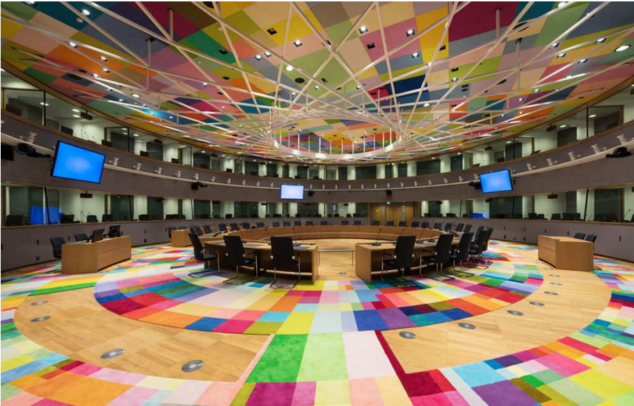
The colourful Council of the European Union

We will give a little more attention to this in the next chapter. But before doing that, I have provided just a few examples below of the many uses in society today of the Rainbow symbol to give you an idea.