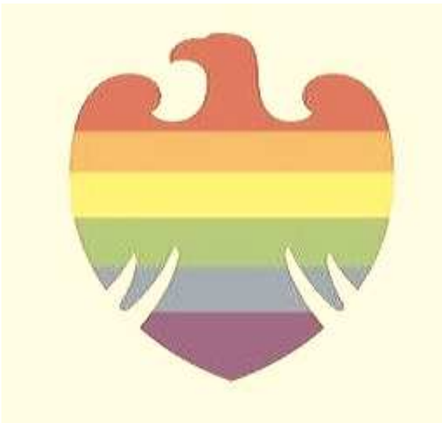
Pride Logo of Barclays Bank

A news article appeared in 2019, entitled, Barclay's new Gay Pride logo is upsetting social media: This is not putting the customer first . Another article appeared in 2020, entitled Barclays Close Christian Charity Bank Account Offering LGBT Conversion Therapy .