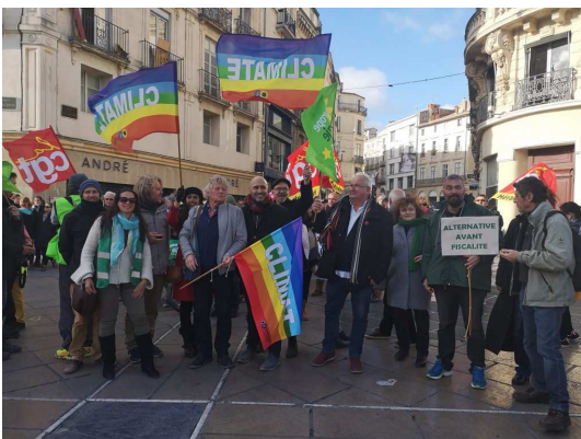
Climate Change protestors