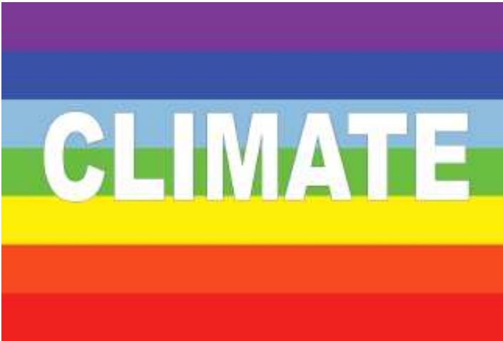
The Climate Flag was used in the UN Climate Change Conference in Copenhagen December 2009