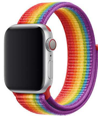
Apple Pride watch