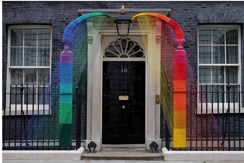
To mark Pride Month 2021 Boris Johnson held a reception to celebrate the achievements of LGBT

The National Health Service (NHS) uses the Rainbow within their organization. Their Rainbow Badge was designed and worn by some staff at hospitals to create an open environment for LGBT+ patients, but its use has become much more prominent globally in the vaccination campaign against Corona Virus.