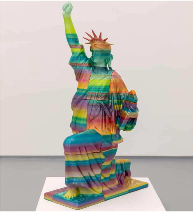
Black Lives Matter Art Work on display in Budapest