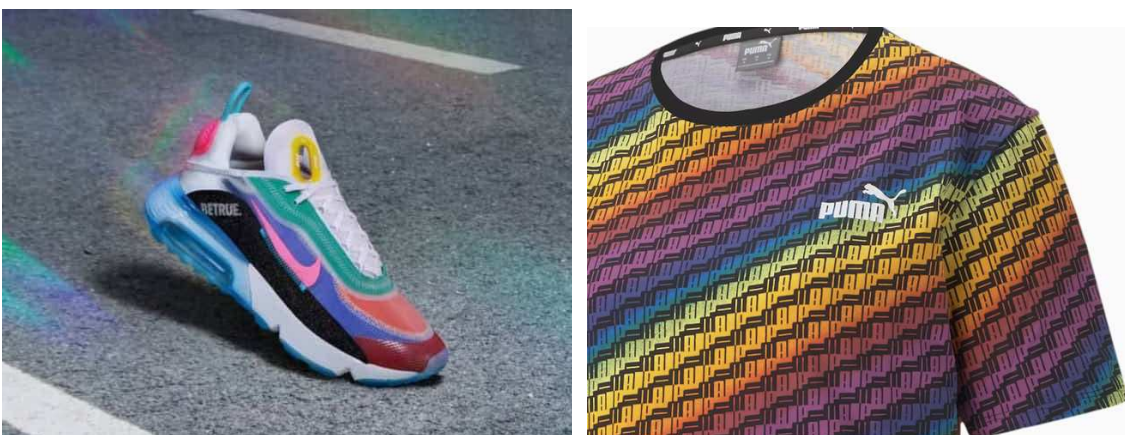
Examples from NIKE and PUMA Pride Collection