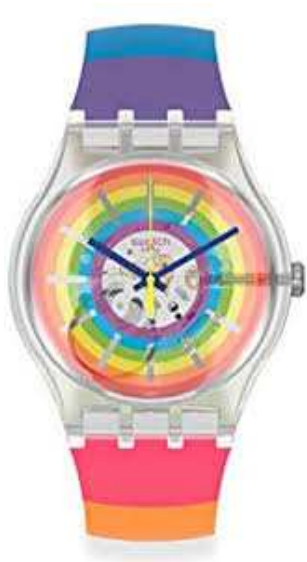
Swatch Watch Rainbow Collection