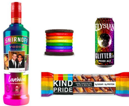
Smirnoff Liquor Producer