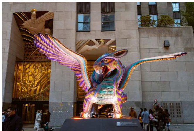
In December 2021 this Rainbow coloured creature, said to be a “guardian of international peace and security,” was placed outside the United Nations building in New York City