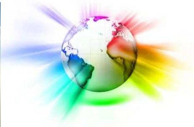
Other Rainbow promotional material for Climate Change awareness