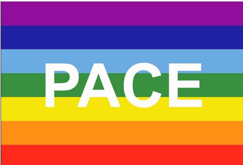
The Rainbow Peace Flag