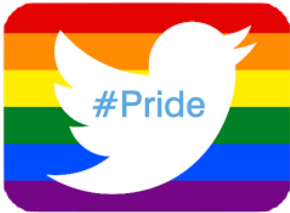
Twitter's Pride Logo