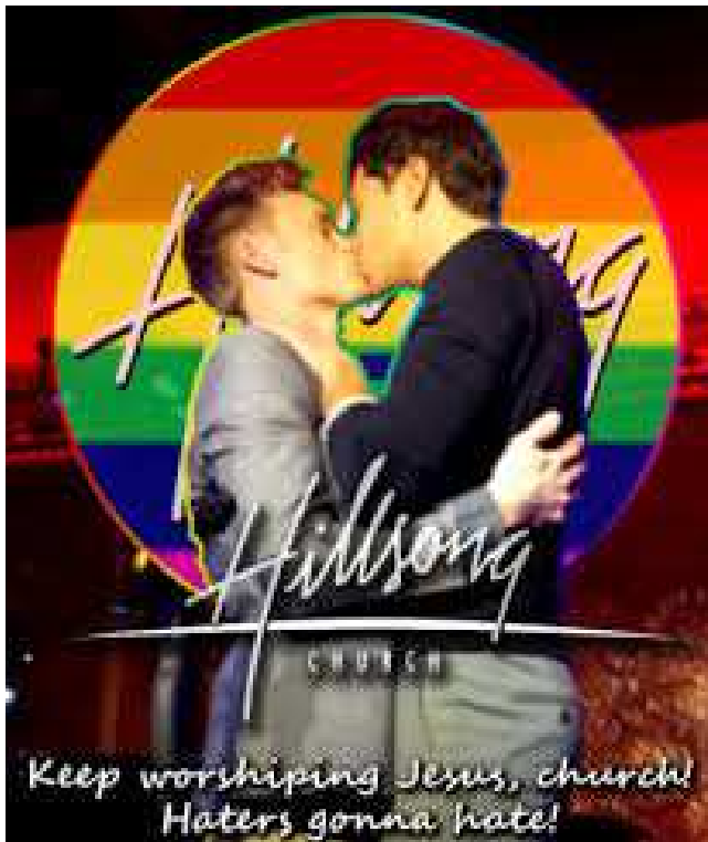
Hillsong's "love" message to gay people