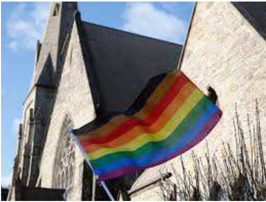
Outside their church building